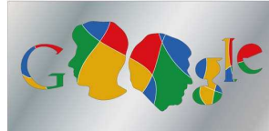
Google (su ordinazione)